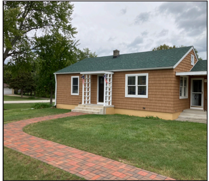
The historic Homart Home, before (at right) and after (above) it was restored by the Oakbrook Terrace Historical Society. The house is now home to the Society's Historical artifact collection.

The Oakbrook Terrace Historical Society is open on Wednesdays 1:00 – 3:00 p.m. For special arrangements, please call 630-834-8661.