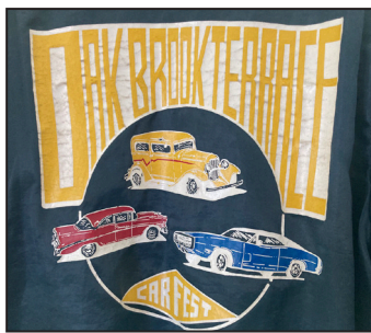
Below: The shows featured Elvis Impersonators, Magic Shows and Hula Hoop Competitions.