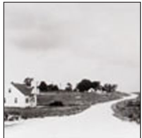
Marshall Road 1940s. Looking north, note the gravel roads and sparse homes.