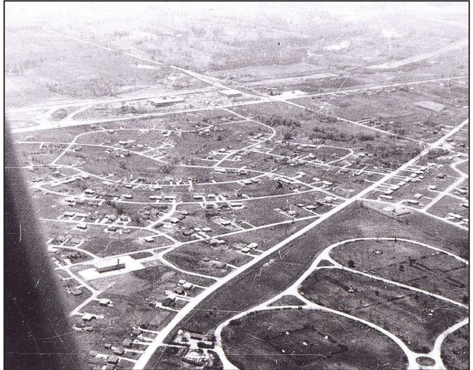
A growing suburb, the Elmhurst Countryside as it looked in this 1957 aerial photo. Note the Butterfield Department, the old fire house, and the new Butterfield School. You can also see the Secretary State Police Headquarters (along 22nd Street) and Andy's Steak House.