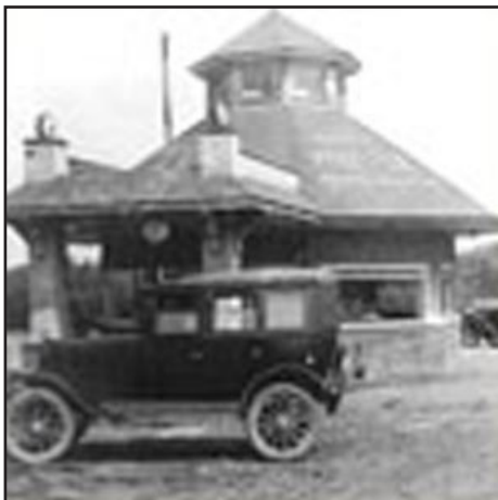
The buttermilk stand at Route 83, Roosevelt Road and Butterfield Road area. Unknown date photo was taken.

Elmhurst Countryside eventually became Utopia, then Oakbrook Terrace.