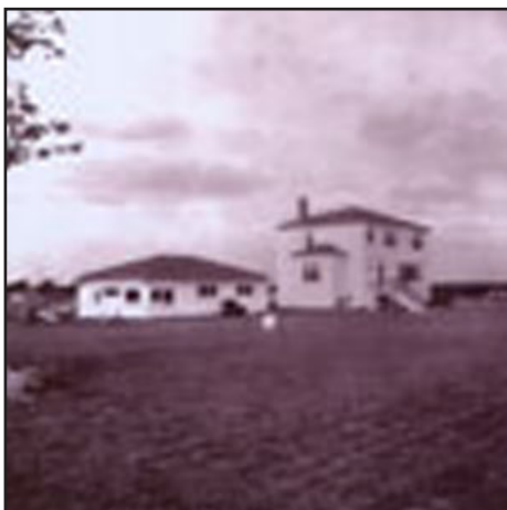
Karban family home, faced 22nd Street in 1950. Relocated to Elm Place