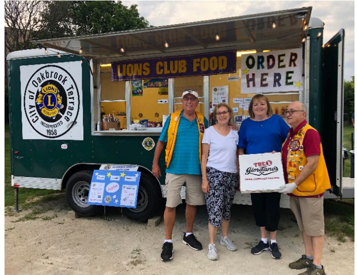
Lions Club volunteers at the Summer Concert Series this year

We sold 687 slices of pizza, 172 waters, 194 sodas, 69 chips, and 188 ice-pops. This was our largest fundraiser of the year. Our next fundraiser for the year is the Holiday trees for our neighbors' front yards. We hope to see you in November when we put your tree up!