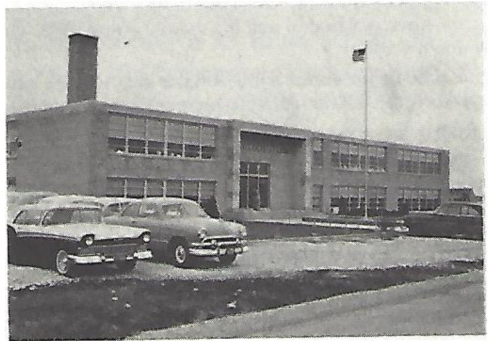
Butterfield School, 1956