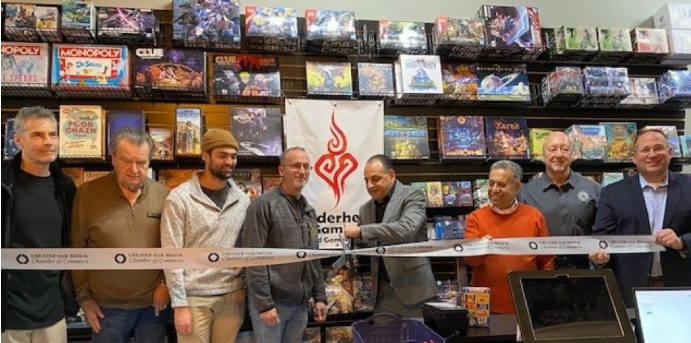
Cinderheart Gaming holds a ribbon cutting for their opening