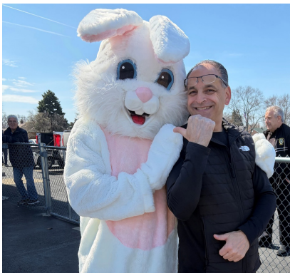
Oakbrook Terrace Mayor Paul Esposito Greets the Easter Bunny