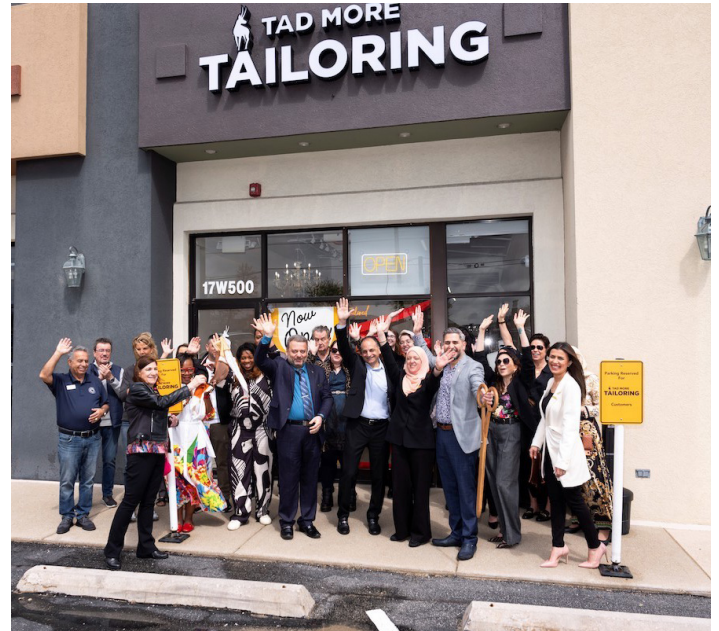
Oakbrook Terrace Mayor Paul Esposito is pictured sixth from the right.