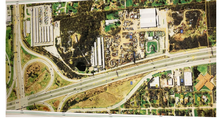
The same property in 2015