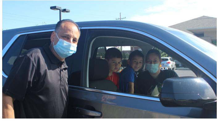
Acting Mayor Paul Esposito greets residents as he and City staff members hand out five $20 vouchers to each family.