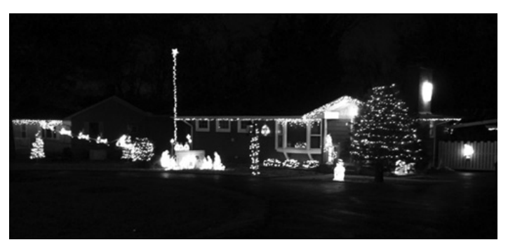
17 W. 381 Eisenhower Rd.