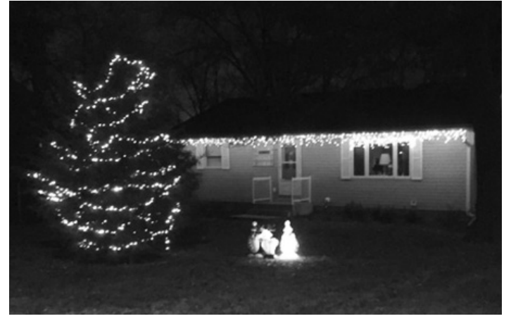
17 W. 371 Eisenhower Rd.