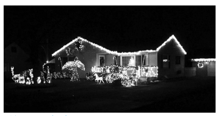
1S422 Wainwright Rd.

consolidated general election will be held on Tuesday, April 2, 2019. In Oakbrook Terrace, this election will include candidates for Aldermen for Wards 1, 2 and 3. You must have registered at least 28 days prior to any election to vote in that election. For more information, please visit www.dupageco.org/election.