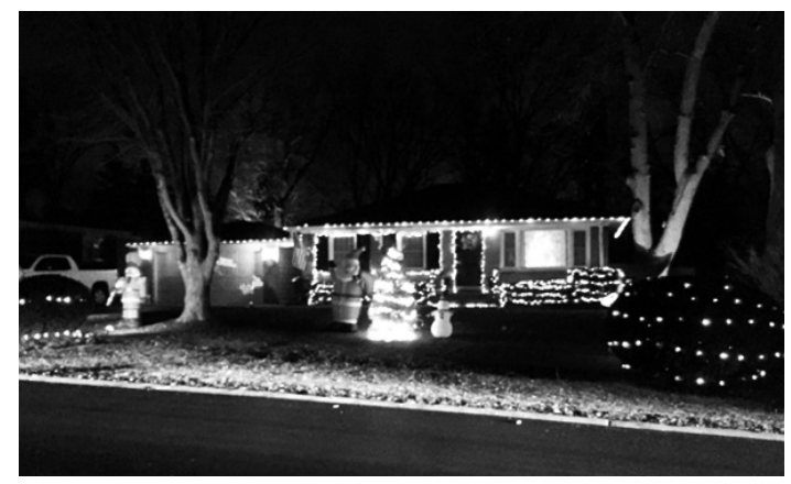
1S451 Wainwright Rd.

This year's Home Decorating Contest participants helped to make the holidays beautiful and bright! Thank you to the following residents for participating.