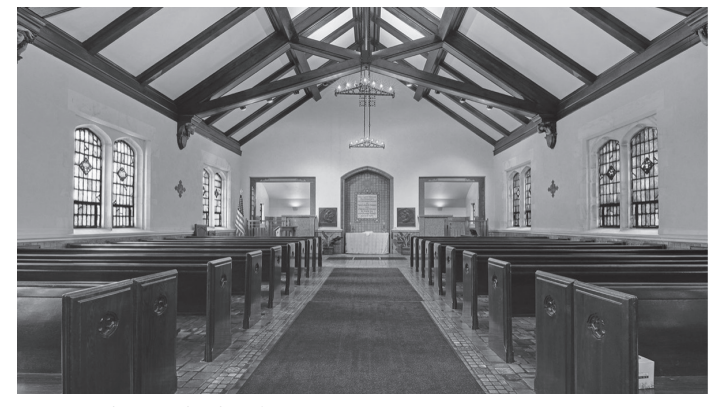
Interior of Hippach Chapel

The chapel includes stained glass windows and carved corbels constructed from solid Massachusetts granite and white Colorado Yule marble, and is adorned with statues. In front of the sandstone