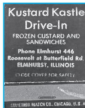
Visiting the Kustard Kastle Drive-In, once located at Roosevelt and Butterfield Roads, was an exciting summertime outing for scores of Oakbrook Terrace families