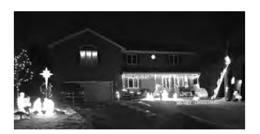
17W314 Halsey Road