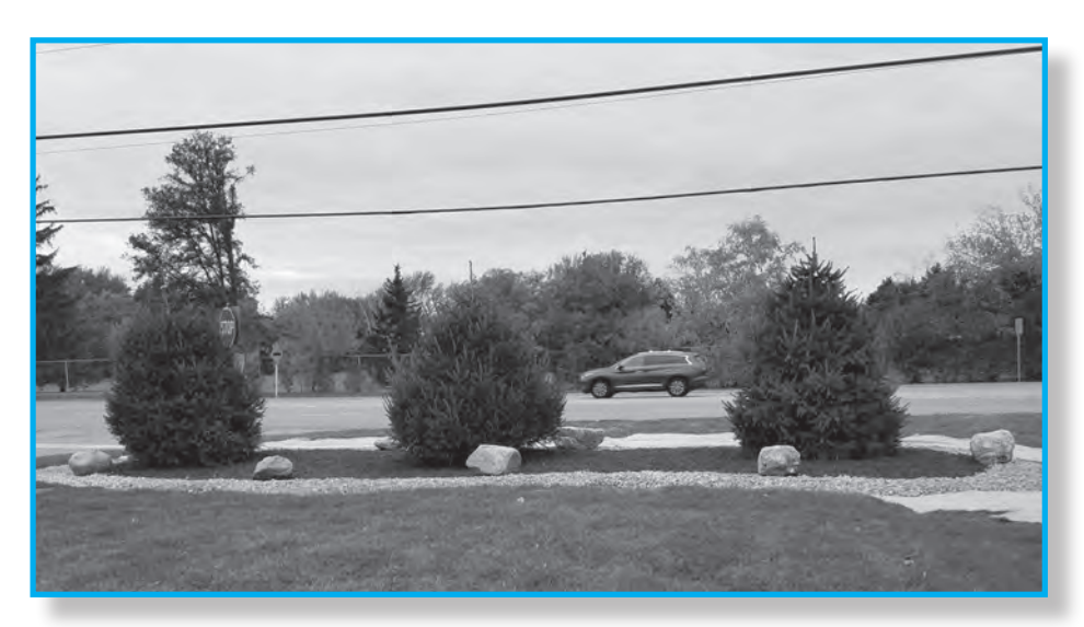
Public Services constructed the new Memorial Garden at City Hall's western end