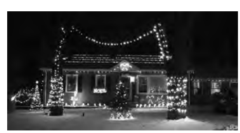
1S 522 Stillwell Road