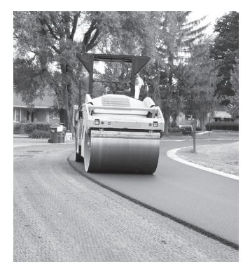
Pictured: the Kreml Park Perennial Garden overhaul above. At right and below, road resurfacing project.