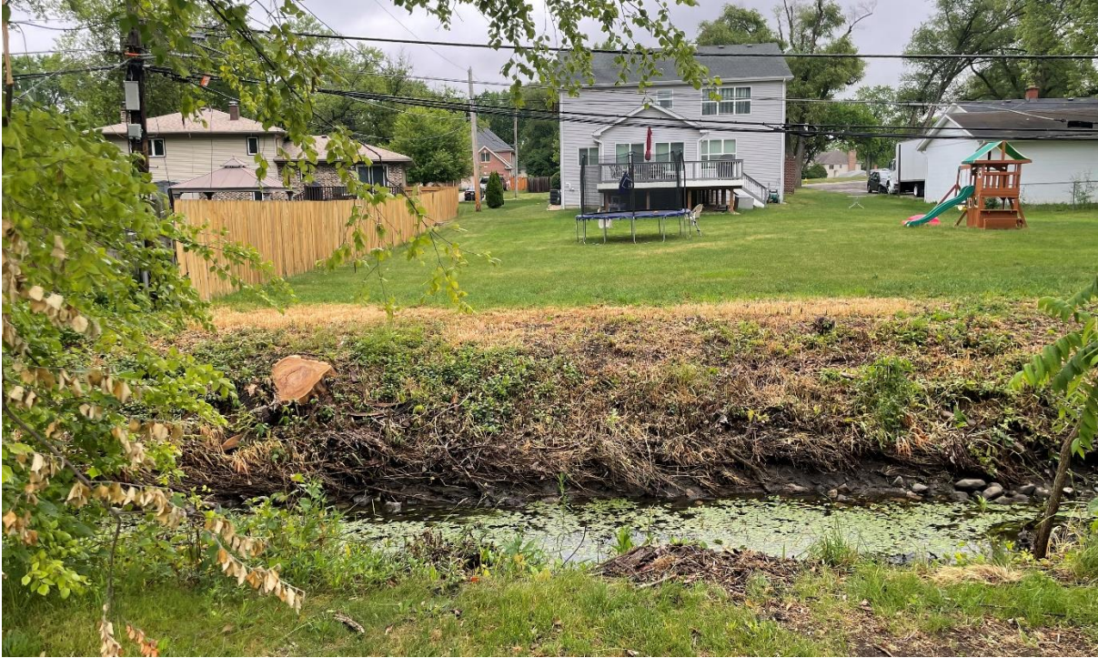
1S566 HALSEY CURRENT