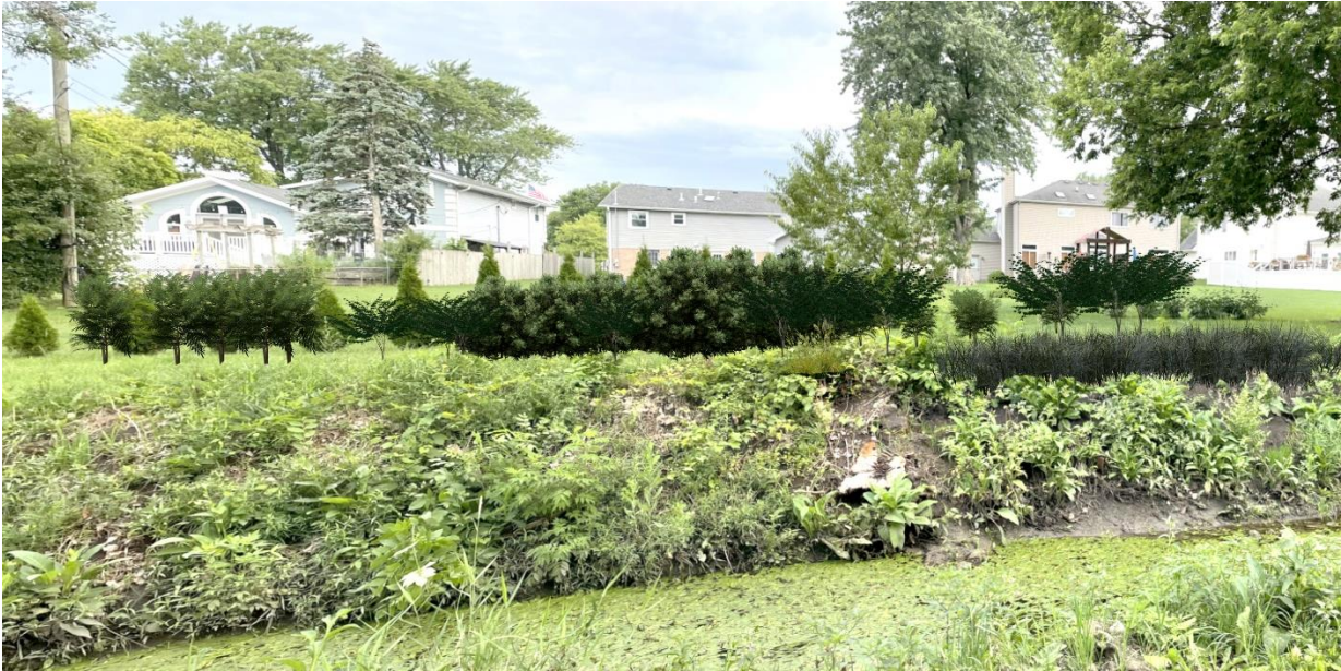
17W453 EISENHOWER PROPOSED