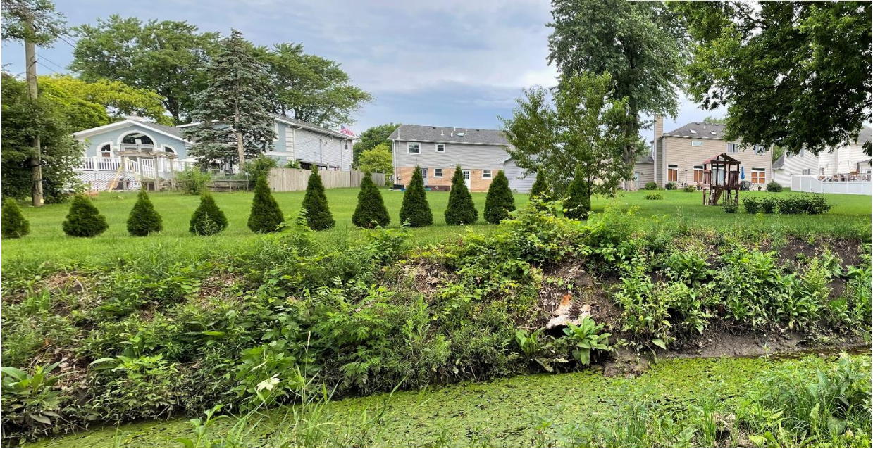
17W453 EISENHOWER CURRENT