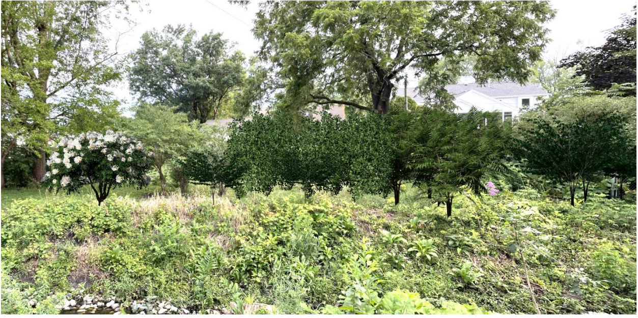
17W401 EISENHOWER PROPOSED