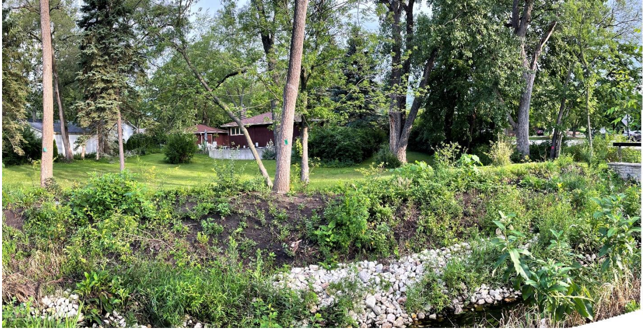
17W361 EISENHOWER CURRENT