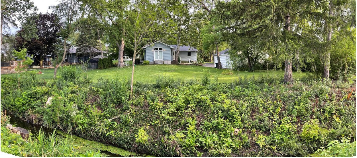
17W371 EISENHOWER CURRENT