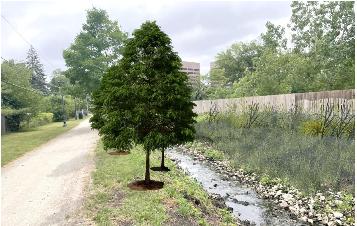
NEAR REI PROPOSED