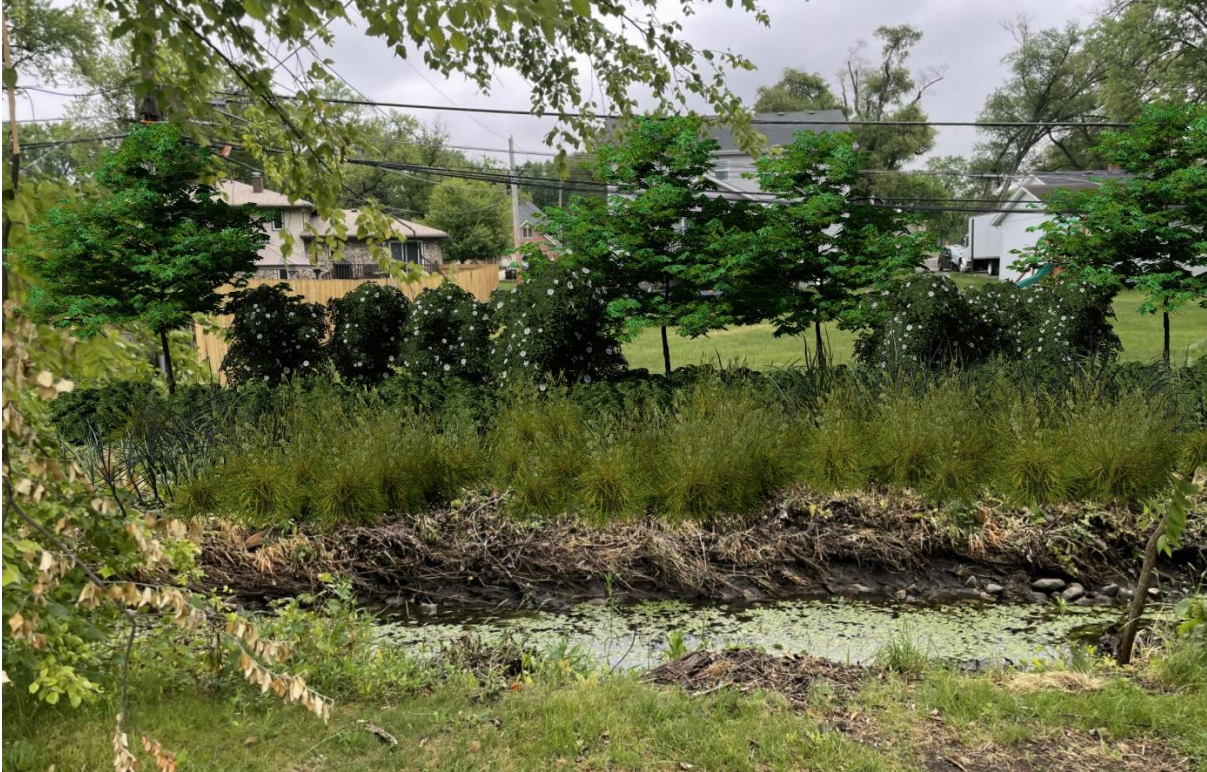
1S566 HALSEY PROPOSED