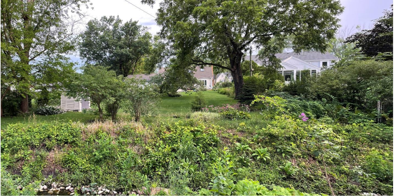
17W401 EISENHOWER CURRENT