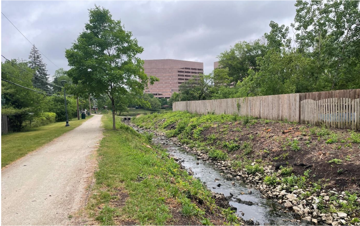
NEAR REI CURRENT