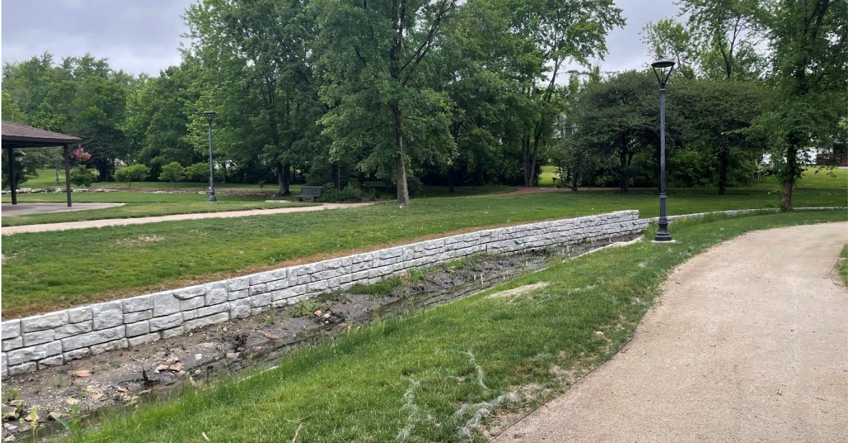
KREML PARK CURRENT