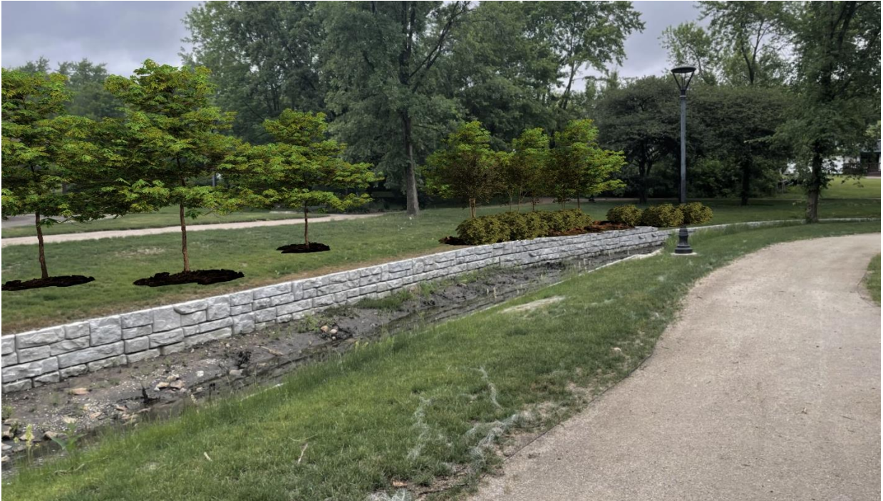
KREML PARK PROPOSED