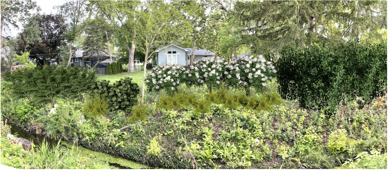
17W371 EISENHOWER PROPOSED